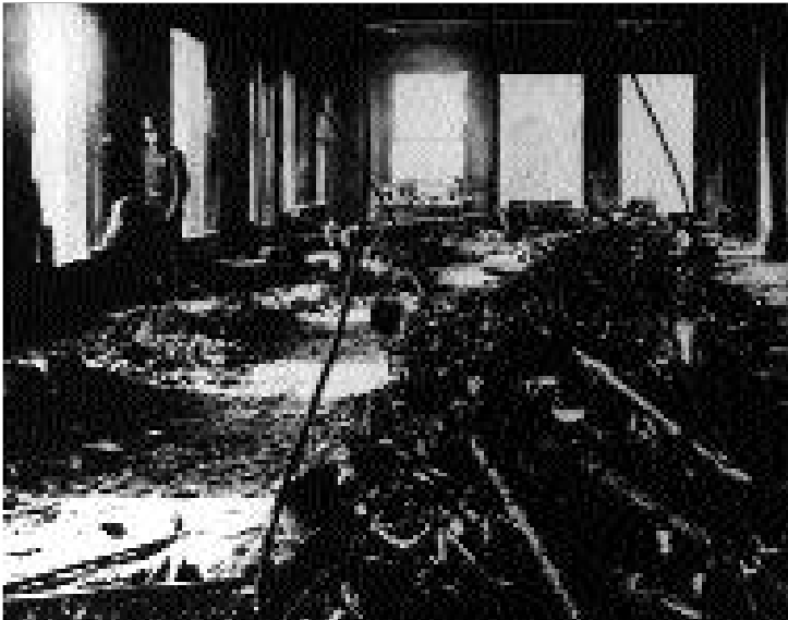
Great sweatshops in American history -- The Triangle Shirtwaist Company after the fire of 1911.